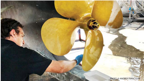
PropOne™ helps maintain maximum performance