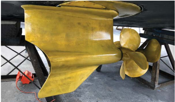
PropOne™ applied to a Volvo IPS™ unit