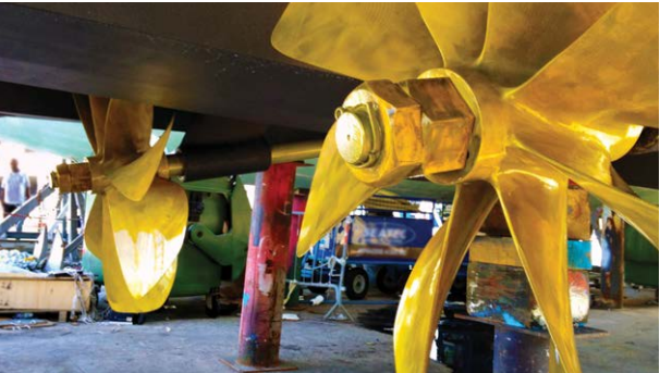
PropOne™ applied to a twin shaft drive